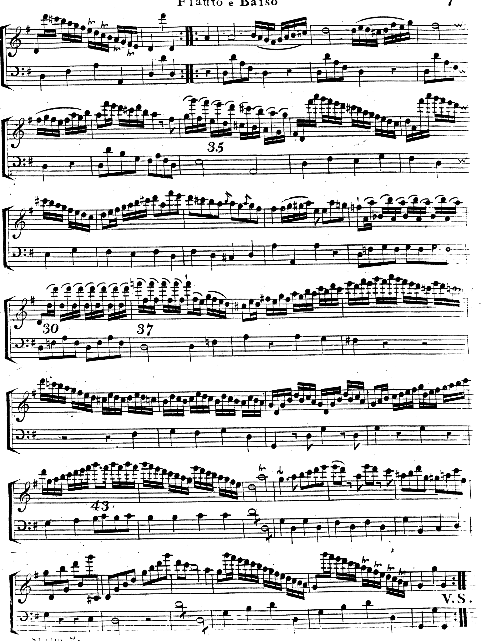
Flauto è Basso